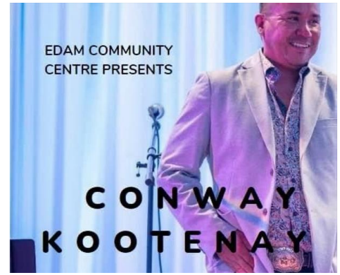
Edam Credit Union sponsored the comedian for the ECRC golf scramble.

We were happy to support Vawn Community Hall with a donation for their annual Mud Volleyball tournament.