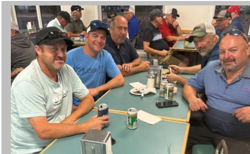
Men's Night was held August 9 th at Mervin Golf Course. Thank you to everyone who golfed.

We were happy to support Vawn Community Hall with a donation for their annual Mud Volleyball tournament.