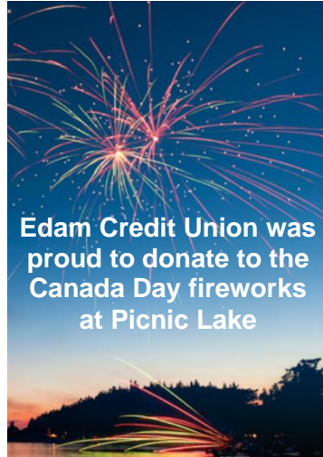
Edam Credit Union was proud to donate to the Canada Day fireworks at Picnic Lake